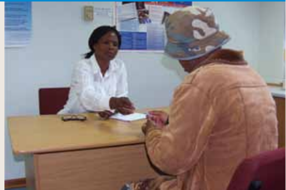
Paralegal of Impendle with a client