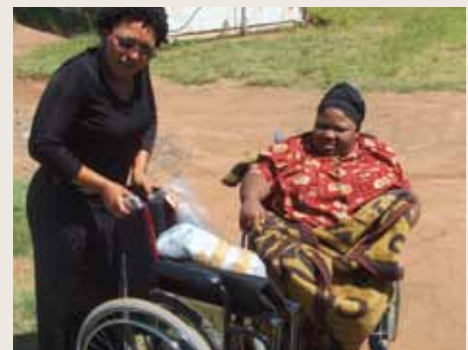
Paralegal of Glencoe with the client she assisted to get a wheelchair