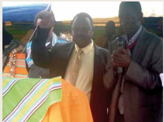
Chief of Mangondi Village, the first citizen of his village to take the public oath taken by men to do all in their power to create Zero Tolerance to any form of Abuse of women and children as well as creating a safer place for women and girls in their communities.

They are starting a new project called a young perpetrators program to address youth specifically; youth is a special group within communities that need to be given specific attention to their issues. They are also looking into research and looking at what are the factors that keep women submissive and non-resistant. So that these cases can be properly processed and that justice gets served, because it is still rape even if the victim becomes submissive to the perpetrator in a situation where they could have found ways of getting out.