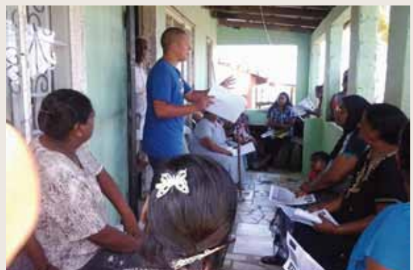
Prevention at home, among friends, family, neighbours.

Ideally, the Western Cape Network on Violence Against Women would like to saturate communities with this prevention training. The more people that know about how to prevent violence against women, the more they will be able to shift negative social norms. This programme is designed in a way that can be driven by communities with less resources, all it needs is people that can influence each other. However, there is some need for funding to be able to deliver training and manage the programmes. Replicating and scaling up such strategies would help communities, and families like Siphó's to take stock of and address violence against women in their midst.