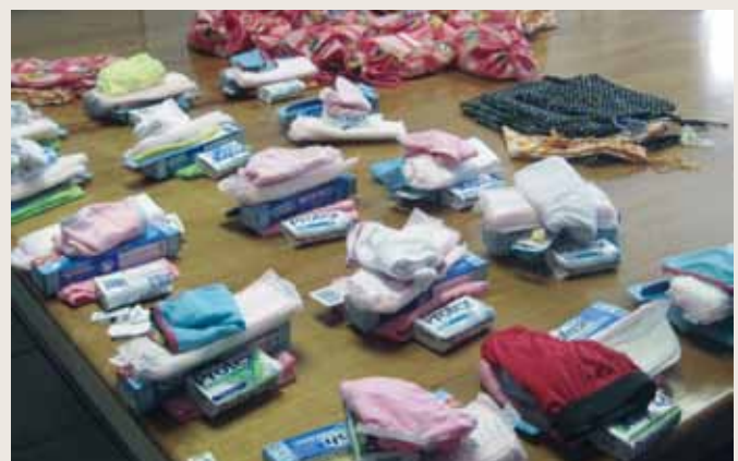
Care packs help survivors get by.

To move ahead, GRIP would like to acquire greater commitment from government. For instance in cases where there is a piece of legislation that makes it difficult to implement the programme, they would like to see government work towards improving the implementation of that particular area of legislation. At the same time if they identify needs, they would like to see greater support in making sure that these are met. For example, if a municipality has a budget to build 100 00 houses, 10 houses could be given to the GRIP shelter for that year. They could also help women through the application process and make sure that they would be able to receive a house from the government. In their future plans they want government to recognize the difference that these programmes have made and that it is cost effective. To then replicate it throughout the country and provide funding for it to be sustained. GRIP provides mandatory statutory services for the government and these services should be ‘contracted’ out to NGO’s, who have the expertise, to provide assistance. *not her/his real name