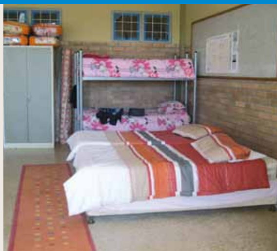
Care rooms provide survivors with a safe and comforting space.